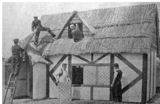
Above- Christchurch Firemen build 5-storey "Hotel" Below- Village Inn. Both buildings destined for flames on Whit-Monday on the Recreation Ground.

The story, as it unfolds, will be explained by a compere and by means of a microphone conveyed to the audience.